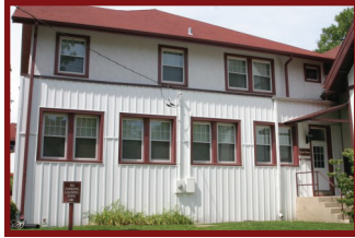
ENTRANCE TO SECOND FLOOR